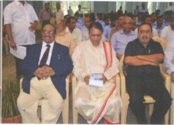
Our revered guests