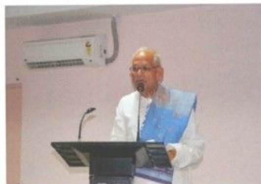
Chief Guest Speech