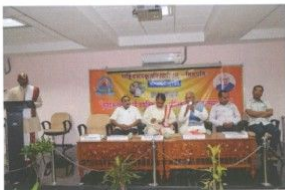
Guests on Dais