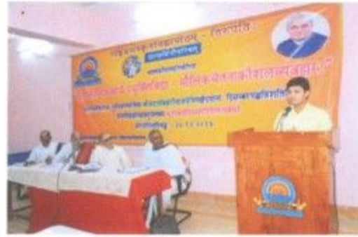
A student is on his way to deliver the speech in front of the Judges